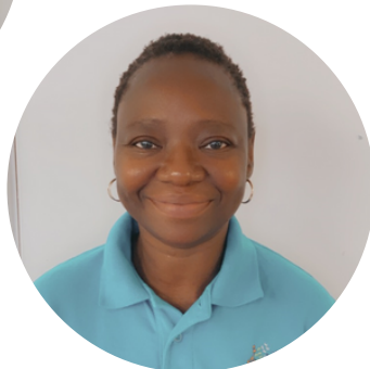
House Keeper & Lunchtime Supervisor